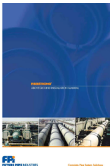
Fiberstrong® Aboveground Installation Manual