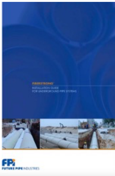
Fiberstrong® Installation Guide for Underground Pipe Systems